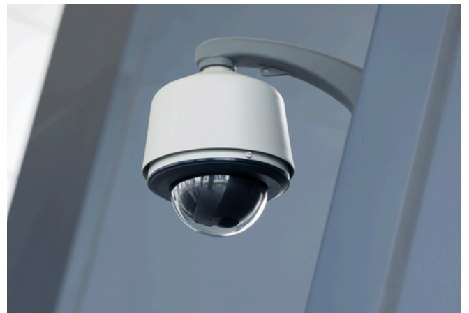
Pan -Tilt -Zoom Camera