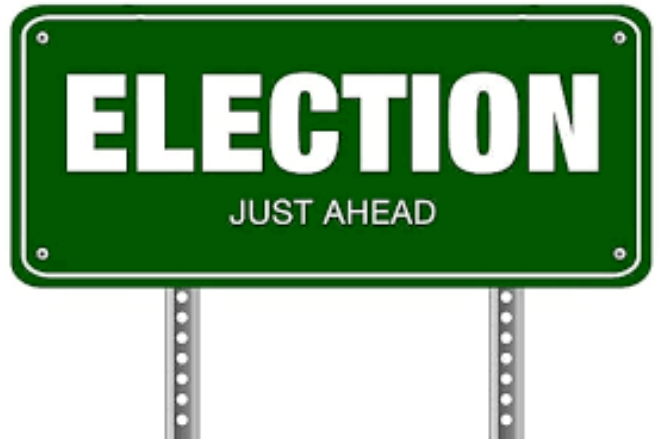
Election sign Boards