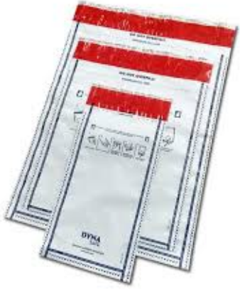
Tamper Evident Envelope