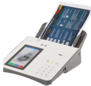
RTS-Result Transmission system