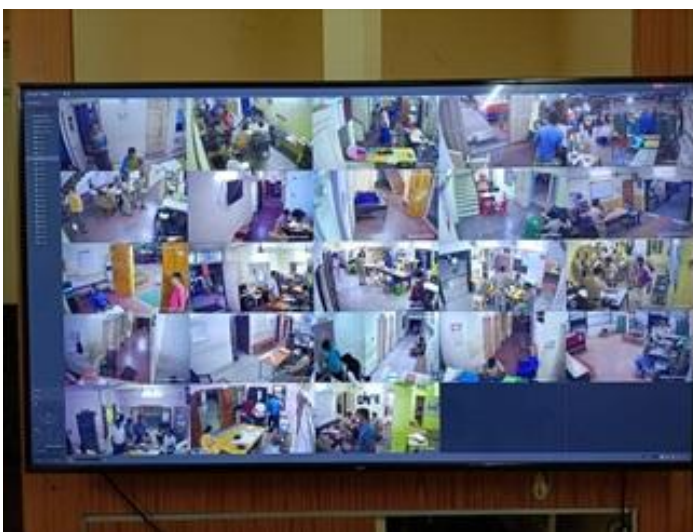
Closed Circuit Television