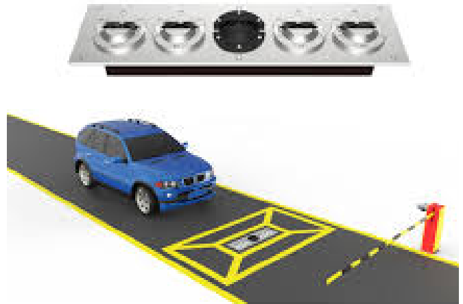
Under Vehicle Surveillance system