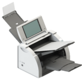
Central Count Optical Scanner