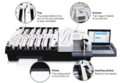
Ballot Reading & Sorting System