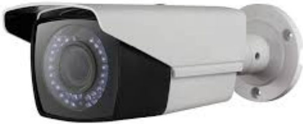
Bullet Surveillance Camera