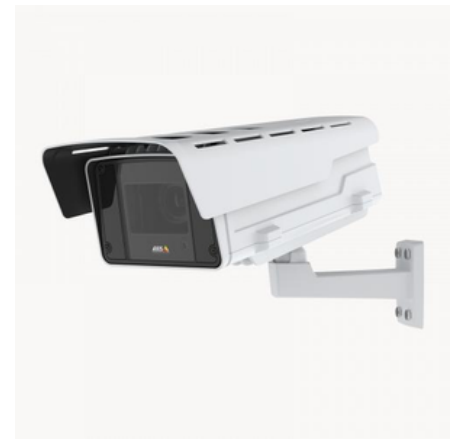
Box type Camera