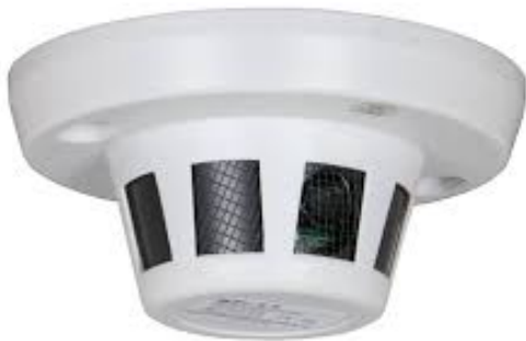
Hidden/Covert Type Camera