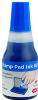
Stamp Pad Ink