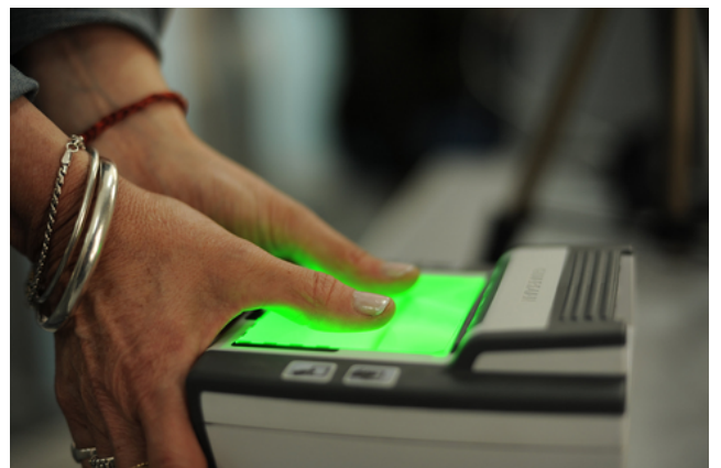
Biometric Voter Registration