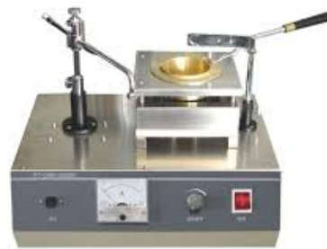
Open Cup Flashpoint Tester