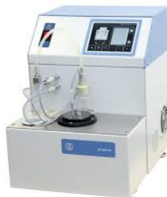
Cold filter plugging point