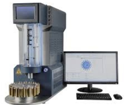
Kinematic Viscosity Tester