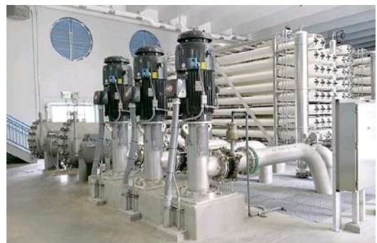
Sea Water Desalination System