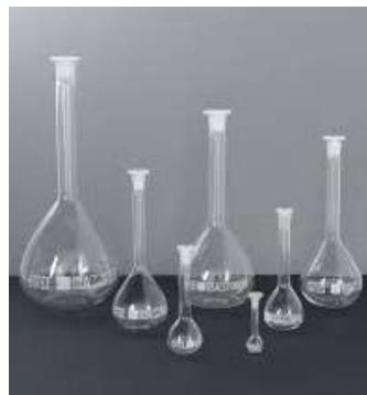
Volumetric Standard flask