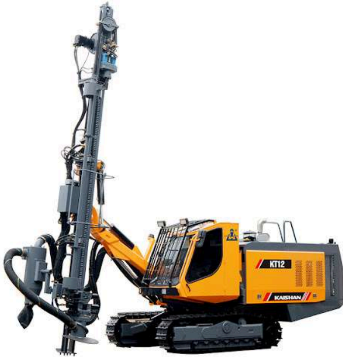
Down The Hole Hammer