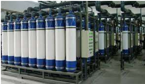
Ultra Filtration System