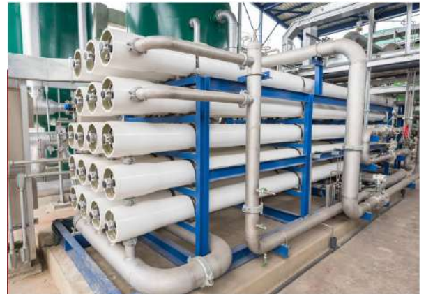
Brackish Water Reverse osmosis system