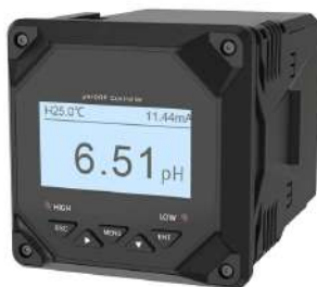
pH Panel Control