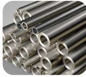
Stainless Steel Pipe