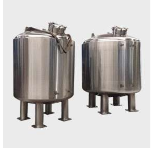
Pure Water tank