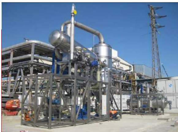
High Saline Water Solutions