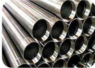
Alloy Steel Pipe