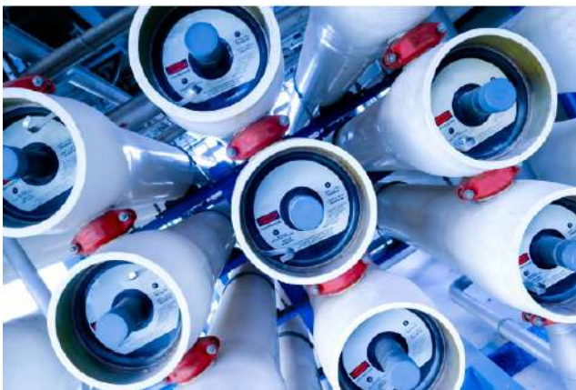
Nano Filtration Unit