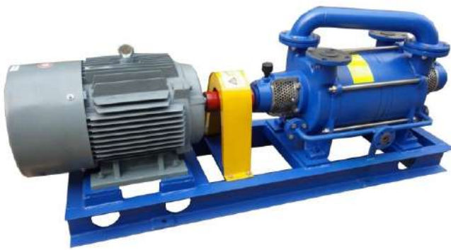
Constant Displacement Pump