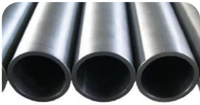
Carbon steel pipe