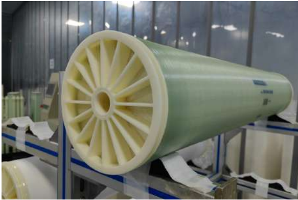
Reverse Osmosis Membrane

Hitech provides top-quality equipment for drinking water treatment plants. The reverse osmosis water purification systems are ideal for regions with high salinity and seawater intrusion, utilizing cutting-edge reverse osmosis technology developed internationally.