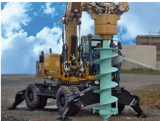
Vertical Auger Drill