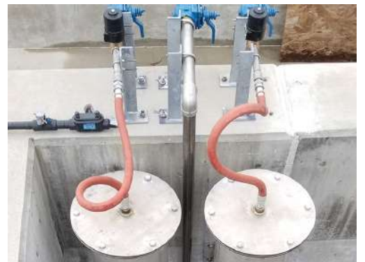
Air lift Pump