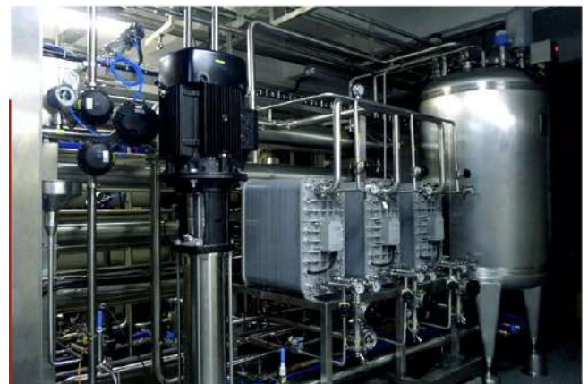
Electro Deionisation/demineralisation system