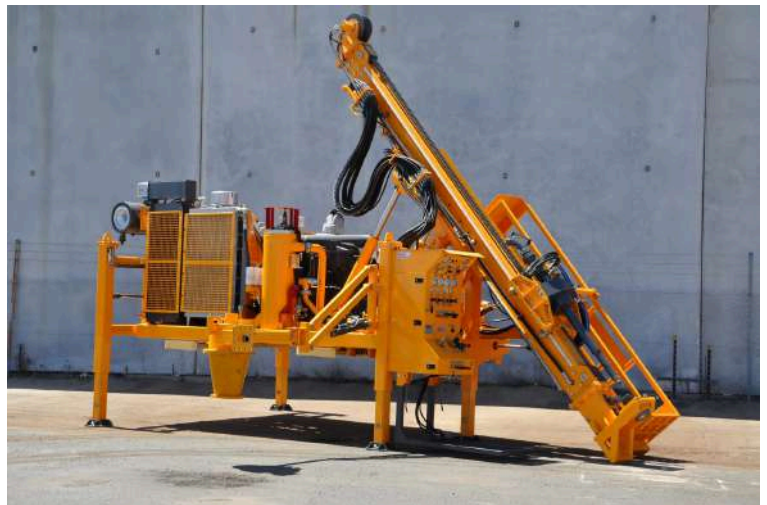
Air Core Drill Rig