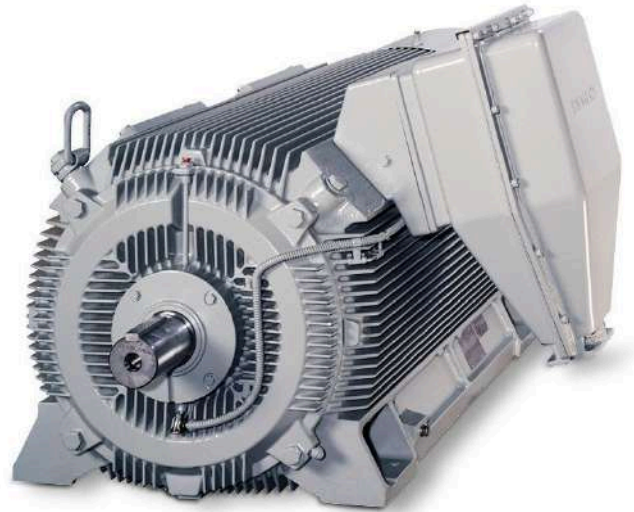
High Voltage Motor