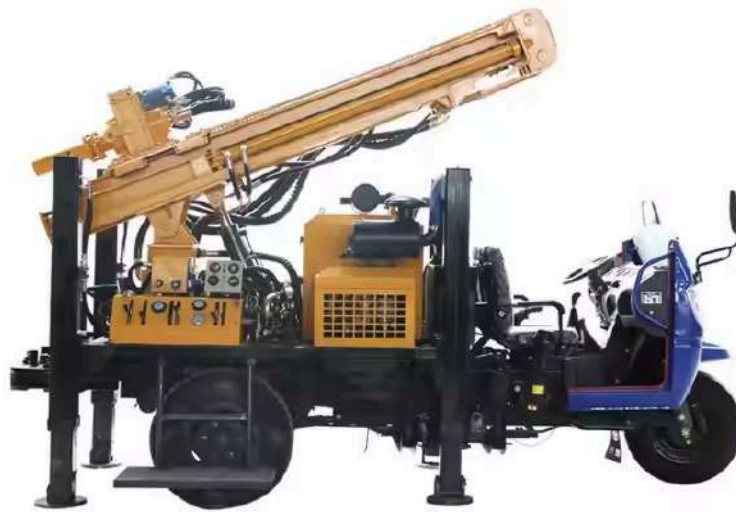
Portable Water Well Drilling Machine