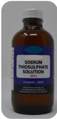
Sodium Thiosulphate Liquid 30%