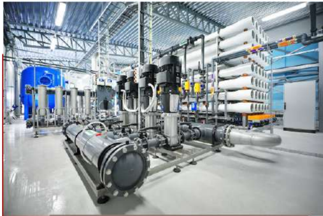
Sea Water Reverse Osmosis System