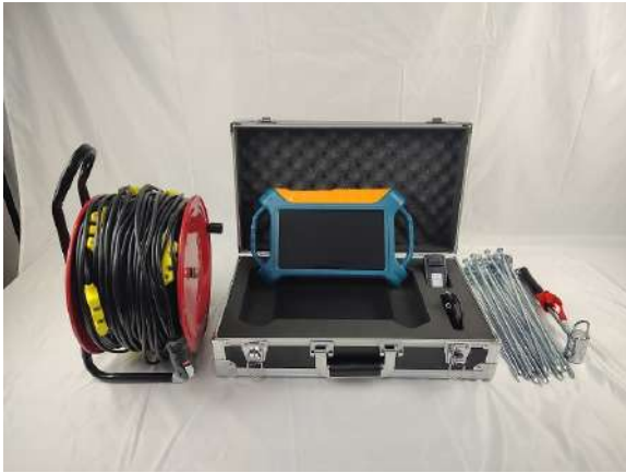
Single Channel Real-time imaging water detector