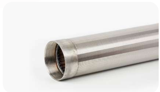
Stainless steel well pipe