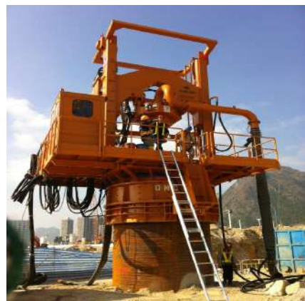
Reverse Circulation Drill