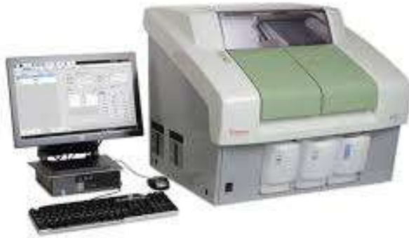
Automated discrete analysis(Wet Chemical )