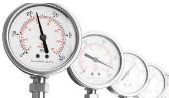
Glycerine Silicone Filled Pressure Gauge