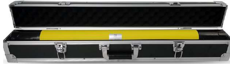
Golden Rod water Detector