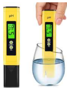
Water Proof pH meter