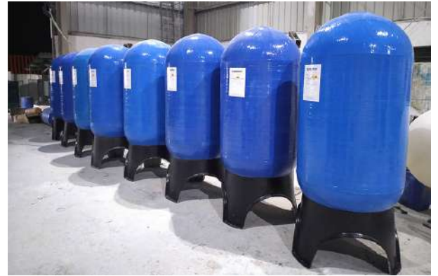
Standard FRP Pressure Vessel