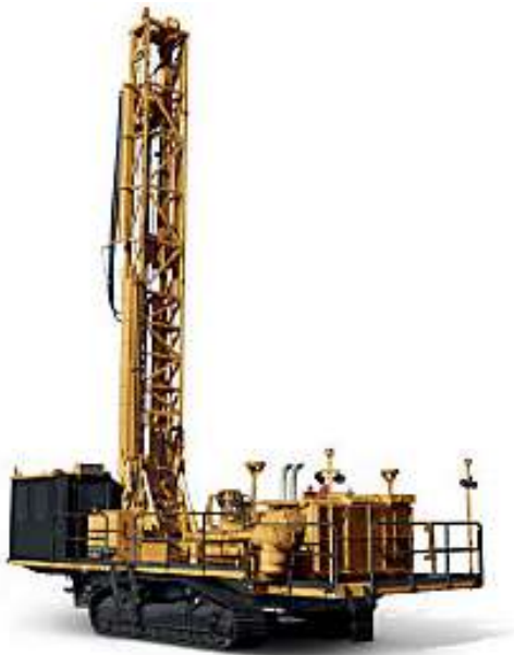
Rotary Blasthole Drills

Hitech offers water well drilling services and equipment, which involves creating holes in the earth's surface to access groundwater sources. While numerous water sources exist underground, they can be challenging to access and often lie at significant depths. Hitech employs advanced drilling technologies and methodologies to ensure efficient and safe drilling operations. Their team of skilled professionals is trained to navigate the complexities of subsurface geology, which can vary significantly from one location to another. This expertise is essential for determining the most effective drilling approach, minimizing environmental impact, and ensuring the sustainability of the water source.