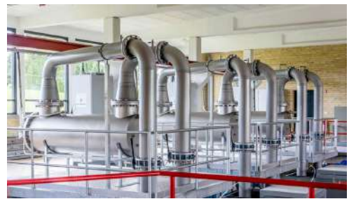
UV disinfection System