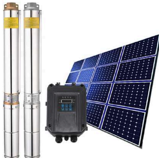
Solar DC Submersible Pump