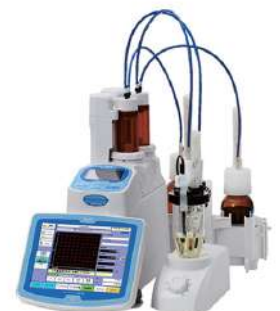
Multi Talent Volumetric Titration