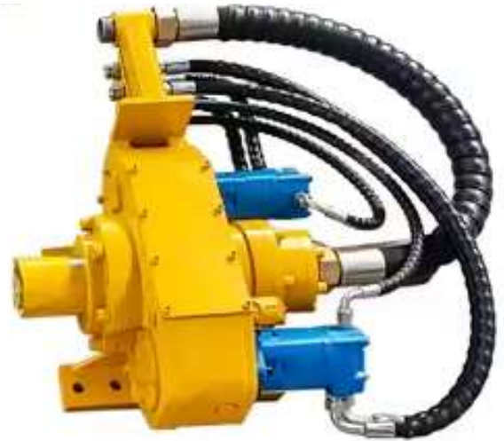
Top Head Drive