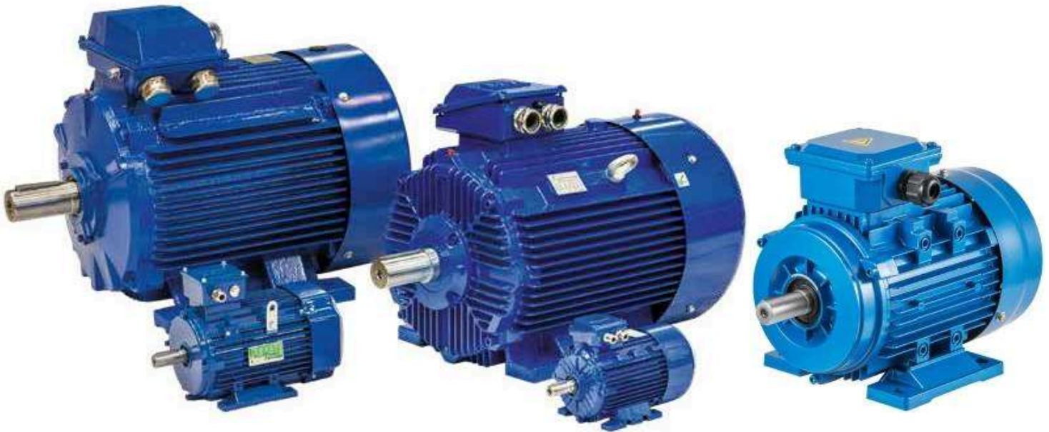
Explosion Proof Motor