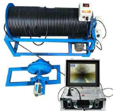
Well Water logging