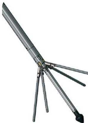
Open Hole logging module