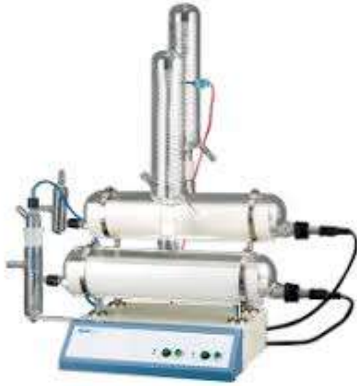
Water Distillation Equipment