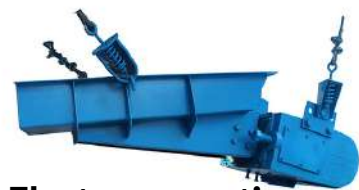
Electromagnetic Vibrator Feeder