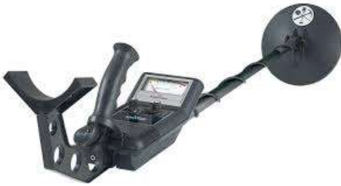
Manual Ground Balance VLF