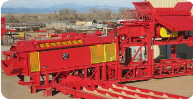
Gold mining wash plant

Trust us for all your mining equipment needs, as we specialize in supplying a range of Gold and Mineral Separation Equipment at Hitech General Trading LLC. Our offerings include Sluice boxes, Metal detectors, Trommels, High bankers, and Drywashers. Additionally, we provide Gold mining equipment such as Dredging machines, Wash Plants, Rock crushers, and Mineral separators.