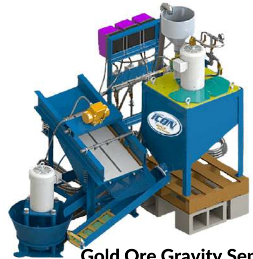
Gold Ore Gravity Seperator