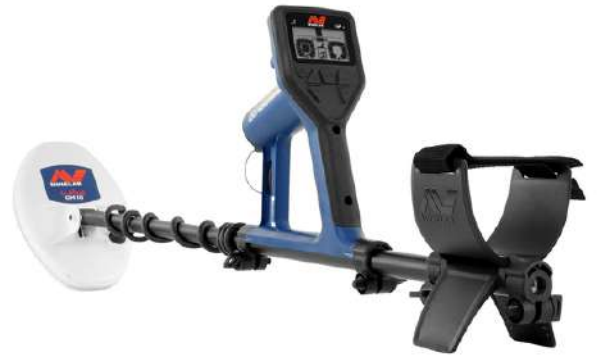
Automatic Ground Balance VLF