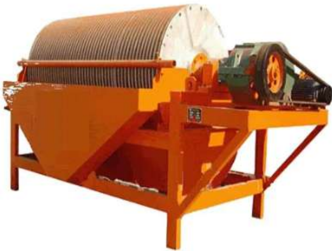
Wet & Dry Magnetic Separator