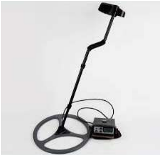
Pulse Induction Detector