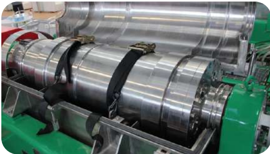
Ore & Mineral Seperation Equipment