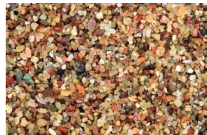
Carbonate Silica Sand