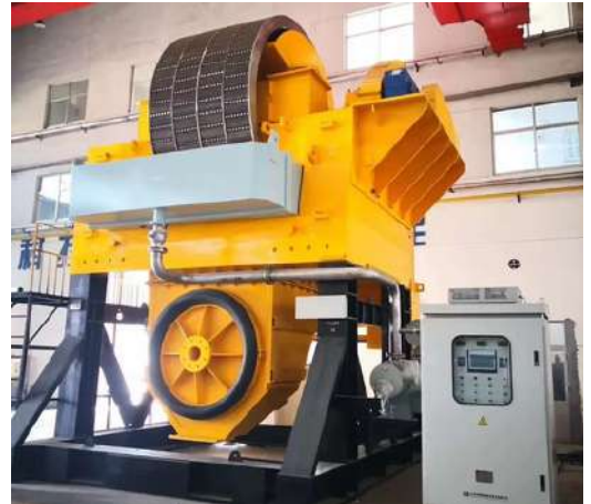
High Gradient Magnetic Separator