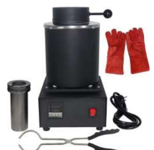
Gold Melting Furnace