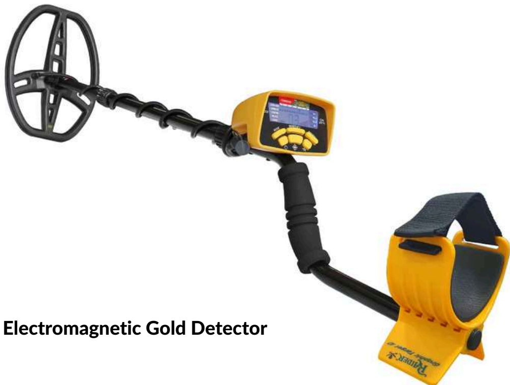
Electromagnetic Gold Detector