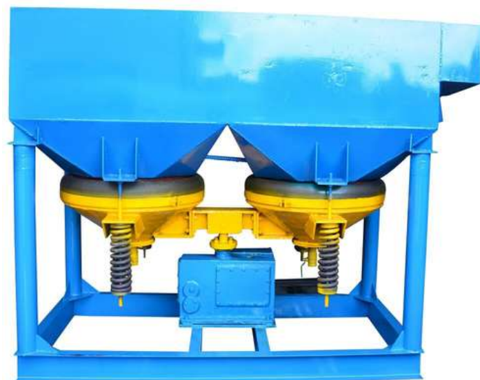
Jig Oil Concentrator