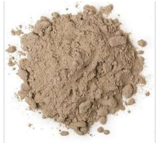
Bentonite Clay Powder