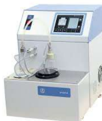
Cold filter plugging point