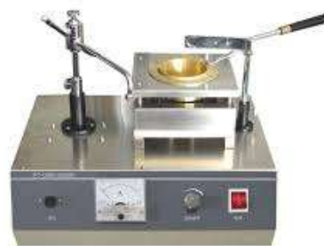
Open Cup Flashpoint Tester