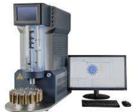
Kinematic Viscosity Tester